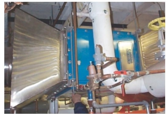
Figure 3 – Stack Economizer Installed on a Boiler Vent