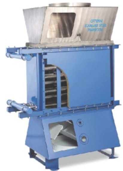
Figure 1 – Stack Economizer

The real energy savings from a boiler stack economizer come from the drop in temperature of the flue gases flowing through the economizer, multiplied by the mass flow rate of the flue gases. A typical non-condensing boiler has a flue gas temperature of 135°C (275°F). A properly sized economizer will drop the flue gas temperature to 77°C (170°F), condensing the flue gases and transferring absorbed heat into the water flow. The economizer can raise the effective seasonal thermal efficiency of these boilers from below 80 percent to nearly 90 percent.